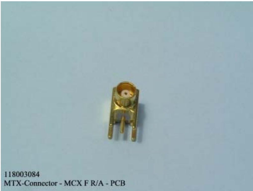
118003084 MTX-Connector - MCX F R/A - PCB