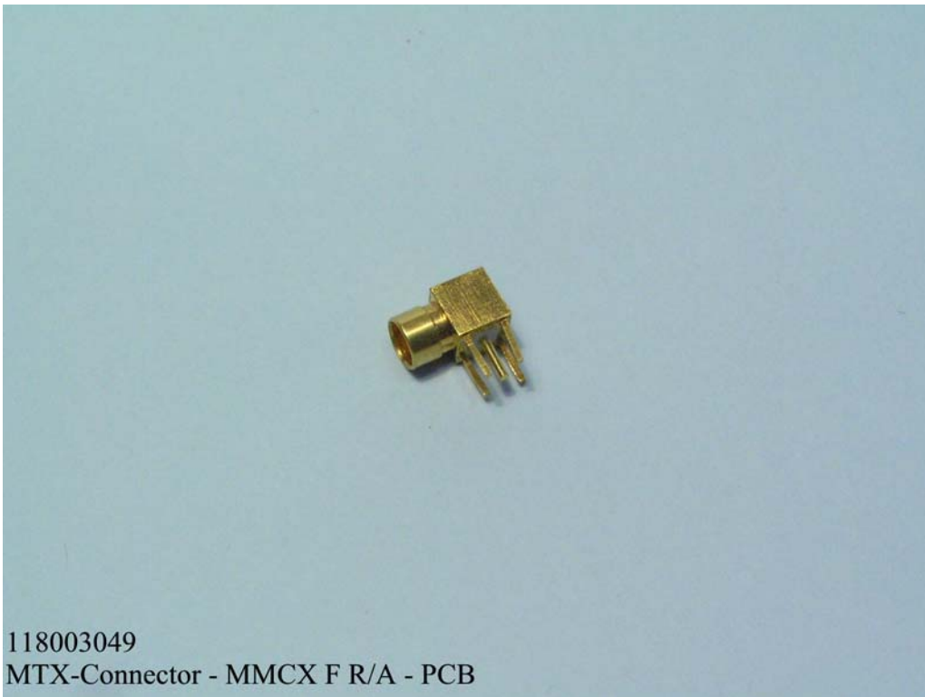
118003049 MTX-Connector - MMCX F R/A - PCB